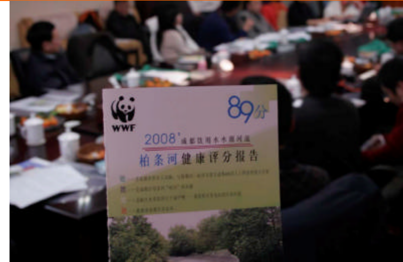
Botiao River Health Scorecard Report issued in the meeting.

The report of river health will be developed into different versions, such as public version, enterprise version and government version in order to accelerate more sectors of the society, including government, enterprise, citizen and farmer in river conservation.