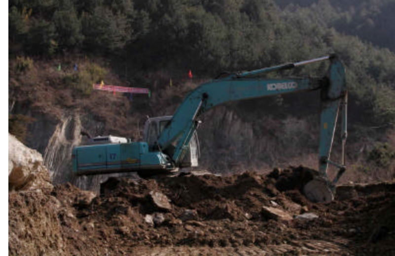
Tunnel construction has been launched in Tudiling corridor areas for reconnection of isolated giant panda populations.

There are about 700 wild giant pandas in Minshan, which are divided into two populations, namely, A and B, by the scientists. Tudiling is the connecting point of the two populations. It was the only path for wild animals in Minshan, such as giant panda and gold monkey in history. The only path was blocked in 1950' because of logging, farming and road construction. In 1980's, people planted a big area of Chinese pine. For many years, other kind of plant is almost extinct because of the high density of Chinese pine. Normally, there are only 190 pines per hectare. However, in Tudiling, the number is over 2,200.