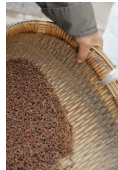
Dried nanwuweizi ( Schisandra sphenanthera ) fruits.