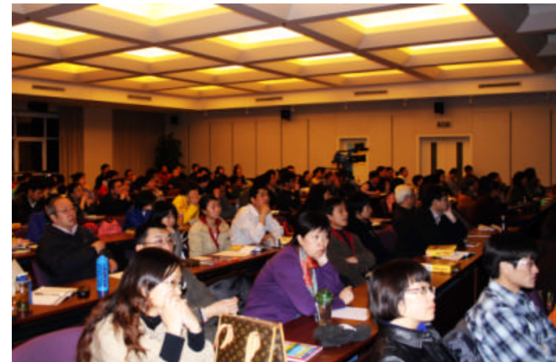
Panda friends on the forum.