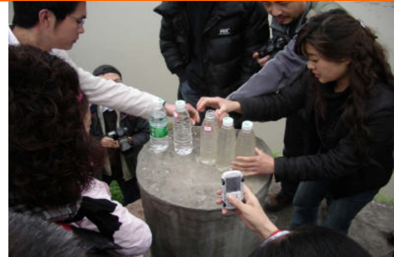
Collecting water from Botiao river.

“In the past, I did not think the river has such close relation with my life. I learnt so much this time and hope to participate more similar activities in future,” a participant said.