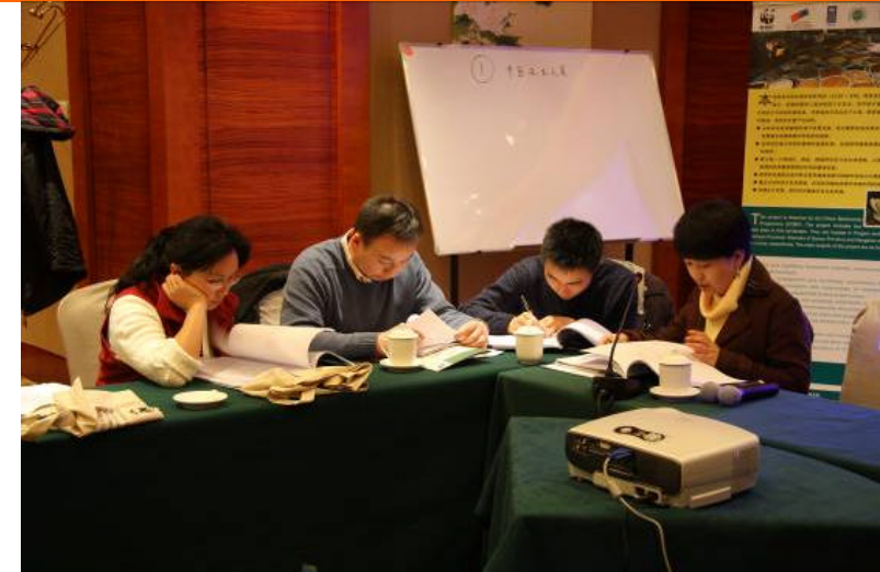
Intensive group discussion in the workshop.

The mountain area in the middle and upper basin of Yangtze River has the important value in biodiversity conservation not only for China but also for the whole world. How to reasonably protect, develop, and sustainable manage and guide the local residents to develop substitutable livelihoods has become more and more arduous and honorable duties for natural resource conservation staff. It requires that we continuously summarize experiences and create new ways to carry out tasks to arouse people’s consciousness of natural resource conservation. Let us look forward together to that day which is full of happiness and satisfaction...for what reason? Eg: for the progress we have made.