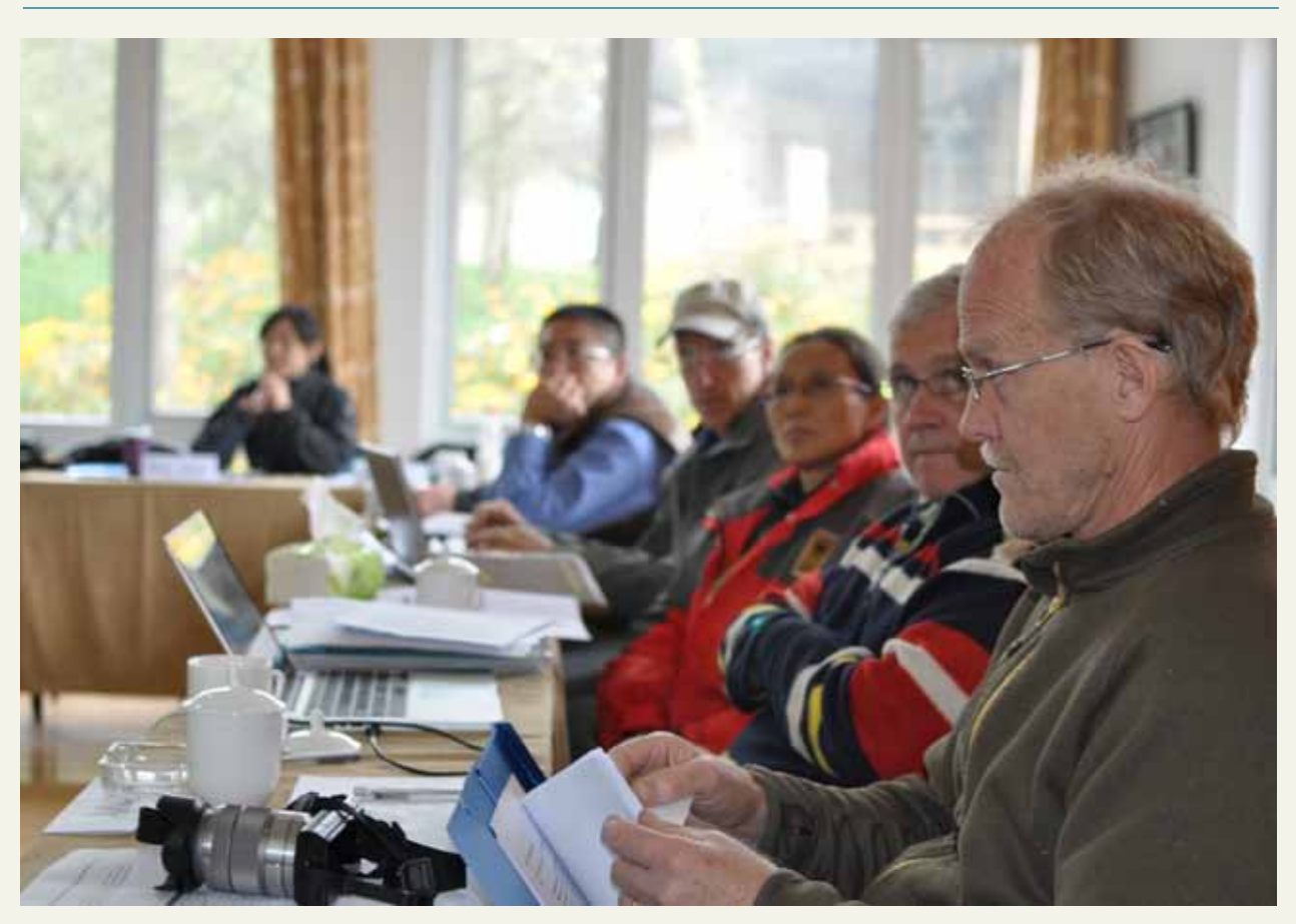
Panda club meeting for the next panda programme.

On October 7th, WWF Panda Programme Team and the Panda Club members travelled to Laoxiancheng Nature Reserve in the Qinling Mountains. The meeting was held in WWF-supported South Taibaishan Environmental Education Center. During the 5-day meeting, the team reviewed the evaluation report to the current panda programme, the achievements on panda and habitat conservation in the last ten years and over Phase II in particular. The threats and challenges were re-examined, and based on this the strategies for next phase were developed and discussed amongst the panda programme team and