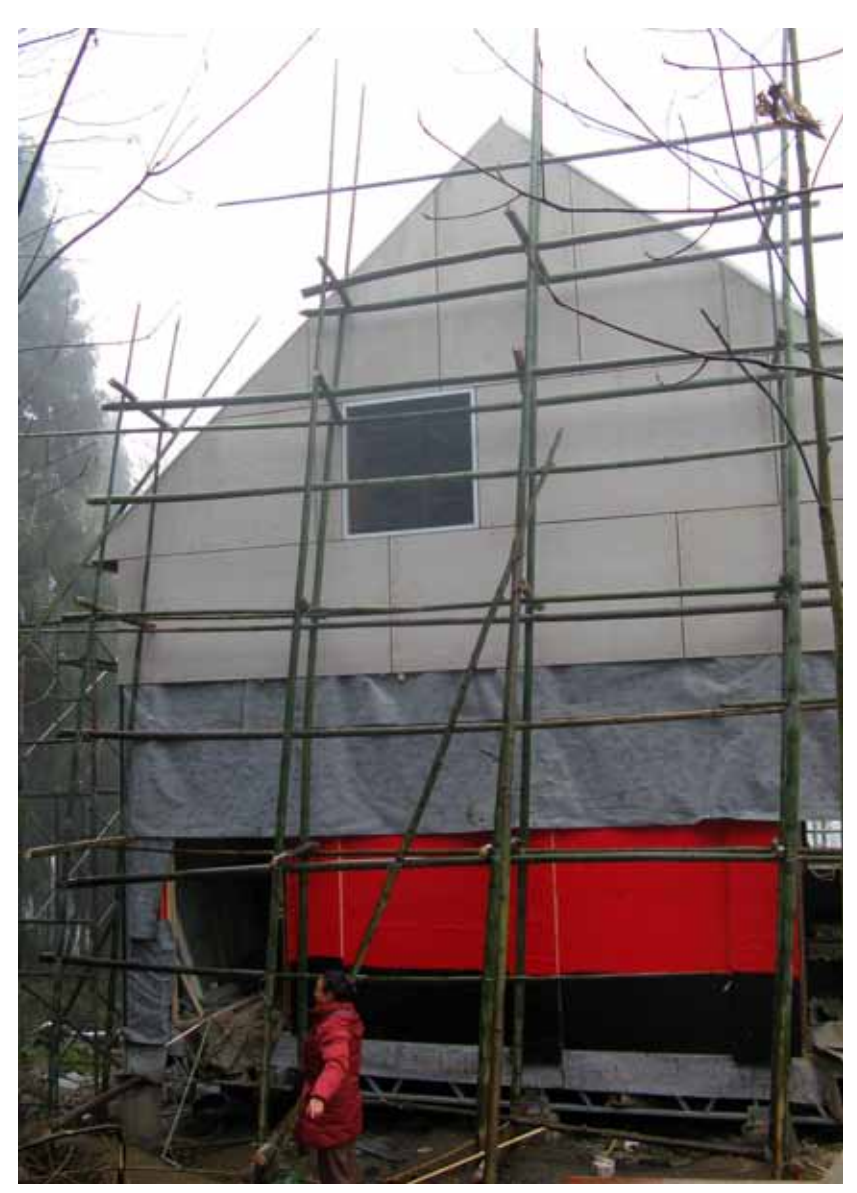
Baishuihe environment education center.

The construction of main body was almost finished, and the center would be open after layout in the beginning of 2013.