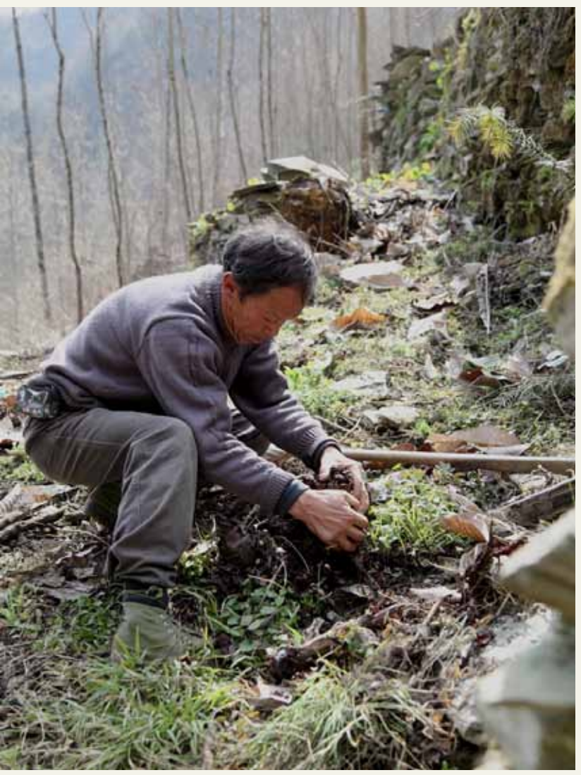
A villager collecting the Rhubarb.

After the traditional Chinese New Year, more Qinglong people will attend the workshops on technical training with support by WWF Chengdu office. Furthermore, some new marketing tools will be introduced to them, like e-commerce. This would be a challenge, but also a great opportunity to them.