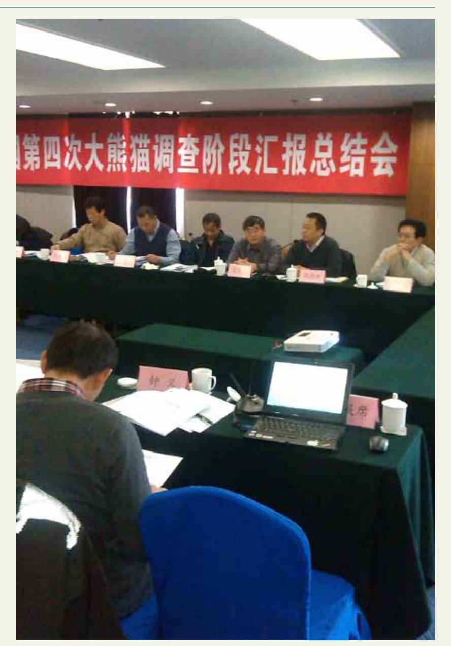
The intermediate reviw on the 4th national giant panda survey.

According the expected plan, the final survey report will be delivered by end of 2014.